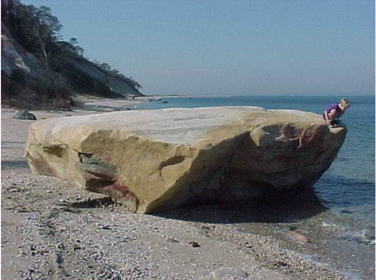
A large glacial erratic on the shore at Caumsett State Historic Park Preserve