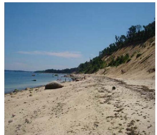
Caumsett, a north shore beach