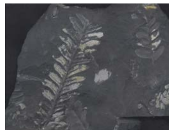
A fossil imprint