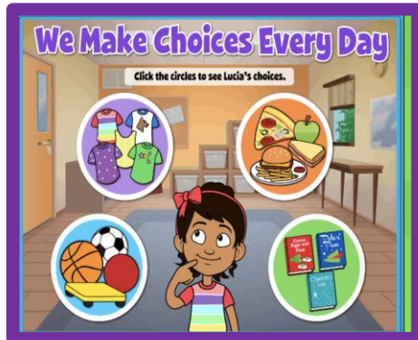
SEL Quaver Lesson: We make choices everyday!