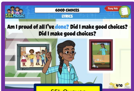
SEL Quaver Lesson: Good Choices Song